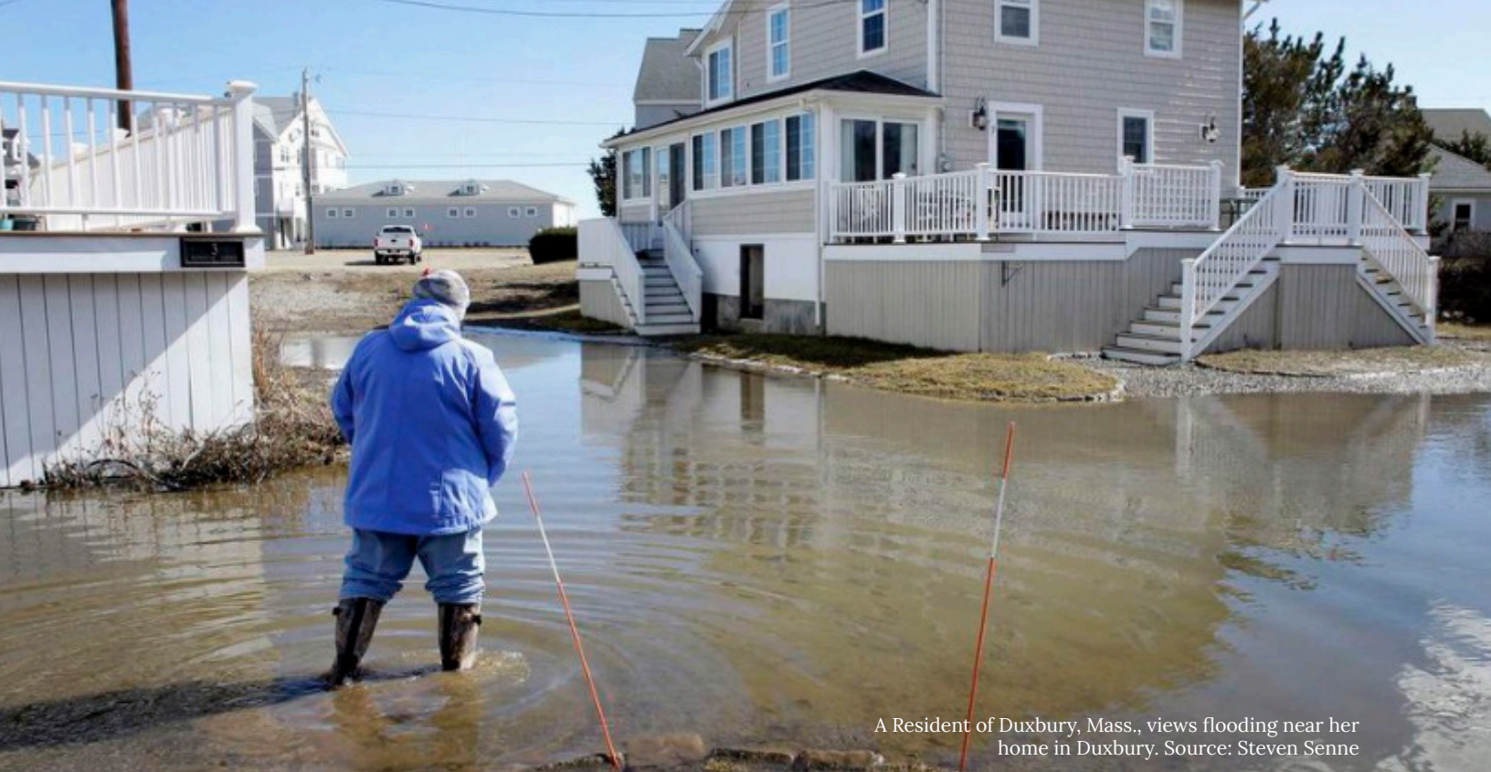
A Resident of Duxbury, Mass., views flooding near her home in Duxbury.